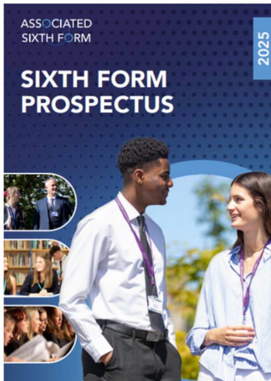
Sixth Form Prospectus