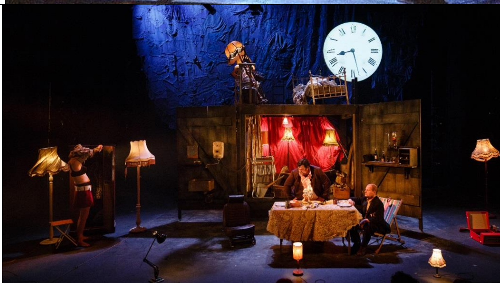
STEPTOE & SON