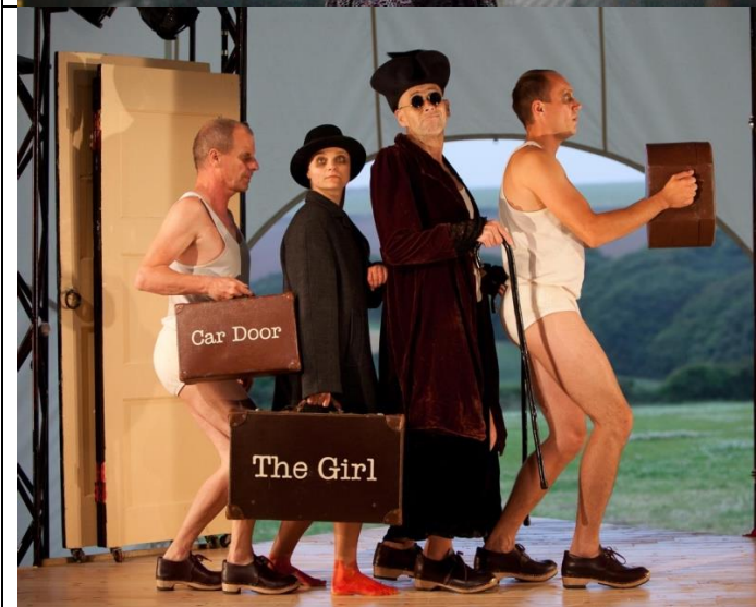
THE RED SHOES