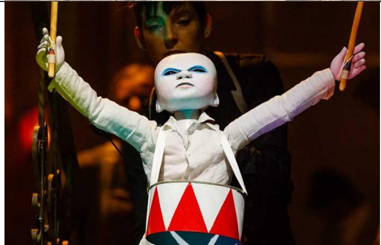
THE TIN DRUM