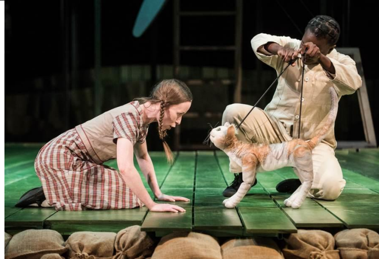
946: ADOLPHUS TIPS