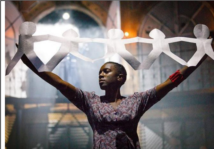
THE TIN DRUM