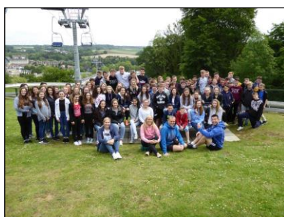
The whole group

This is an exciting opportunity for both boys and girls who enjoy playing football and hockey as you can combine three fixtures against local clubs together with visits to the surrounding areas. You will be based in Valkenburg situated in the province of Limburg, one of the most unusual parts of Holland – it has hills! Its inland position close to the borders of Germany, Belgium and Luxembourg, provides a great venue for your sports tour. With formidable local sports teams Valkenburg is an excellent destination. It is also a safe and cosmopolitan town with good recreational facilities and a pedestrianised centre which enables pupils to explore safely.