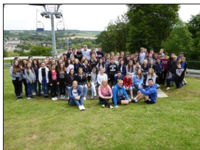
The whole group

This is an exciting opportunity for both boys and girls with a particular interest in sport to combine three fixtures against local clubs combined with visits in the surrounding area. You will be based in Valkenburg situated in the province of Limburg, one of the most unusual parts of Holland – it has hills! Its inland position close to the borders of Germany, Belgium and Luxembourg, provides a great venue for your sports tour. With formidable local sports teams Valkenburg is an excellent destination. It is also a safe and cosmopolitan town with good recreational facilities. The pedestrianised centre enables pupils to explore safely.