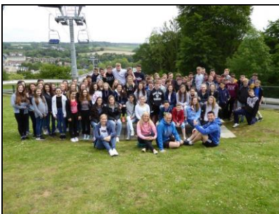
The whole group

This is an exciting opportunity for both boys and girls with a particular interest in sport to combine 3 fixtures against local clubs combined with visits in the surrounding area. You will be based in Valkenburg situated in the province of Limburg, one of the most unusual parts of Holland – it has hills! It's inland position close to the borders of Germany, Belgium and Luxembourg, provides a great venue for your sports tour. With formidable local sports teams Valkenburg is an excellent destination. It is also a safe and cosmopolitan town with good recreational facilities. The pedestrianised centre enables pupils to explore safely.