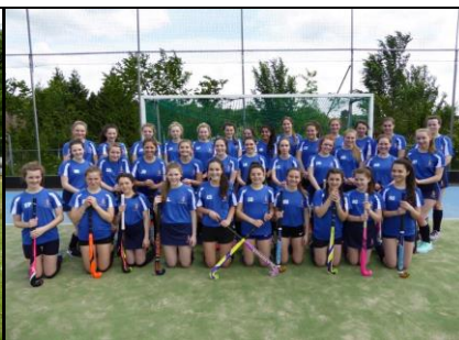
Girls Hockey teams